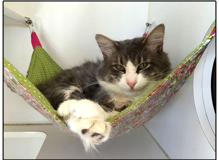
Corduroy enjoying his hammock when he was at OAS.