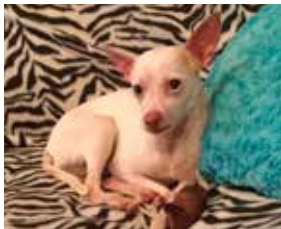
Before and after photos of a rescued chihuahua

Thanks to the hard work of OAS and FOAS staff and volunteers, all 46 dogs were transferred to OAS adoption partners across various states. This work would not be possible without the FOAS-funded transfer coordinator position that sends over 2,100 animals to adoption partners every year.