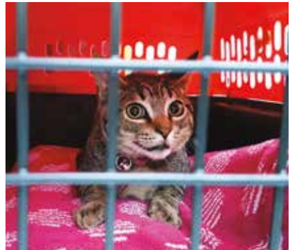
Minnie waits her turn for surgery at a September PetFix event

Through PetFix, Oakland residents can attend one of our monthly spay/neuter events in Oakland or take advantage of