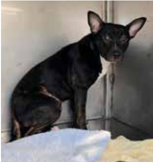
Jelly Bean at the shelter, too frightened to walk

Thanks to FOAS donors, we were able to end the excruciating pain and preserve the mobility of an adorable mutt, Jelly Bean. When she arrived at the shelter, Jelly Bean was so terrified and shut down that she had to be carried out of her kennel. The shelter's animal behaviorist, a FOAS-funded position, knew she would benefit by getting a break from the shelter. Through her efforts and FOAS's foster program, Jelly Bean was placed in a loving foster home where she instantly blossomed into a lovable, playful, energetic dog.