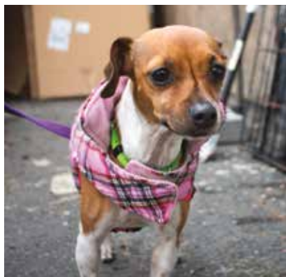
Dressed to impress for her spay appointment at a PetFix event!

Are you an Oakland resident who needs spay/neuter surgery for your dog or cat? Find out more at oaklandsanimals.org/ petfix