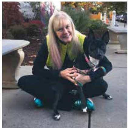
Jelly Bean with her new mom

Her options were: 1) a lifetime of painkillers and likely deterioration of her leg, 2) amputation of her leg, or 3) an expensive TPLO surgery (similar to ACL surgery on a human knee)—a cost of $10,000 for the right leg alone. We knew we wanted to give Jelly Bean a chance at living the fullest life possible. Thanks to the generosity of many FOAS donors, including an anonymous donor who matched the first $5,000 raised, Jelly Bean was able to get her surgery. The generosity of FOAS' donors was apparently infectious—the veterinarian who performed the surgery also performed a pro bono surgery on Jelly's left leg. What could possibly be sweeter than this? Well, Jelly Bean found her forever home just in time for the holidays! Here she is, putting a big smile on her new mom's face.