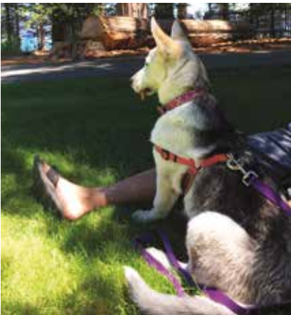
Sugar, camping in Tahoe

As Oakland’s only open-door shelter, OAS alone has the daunting task of providing care for animals rescued from any criminal abuse cases in our city. The FOAS medical fund means that even animals like Sugar and Qi’ra, terribly injured by their abuser, can go on to live the life we believe every animal deserves.