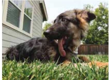
Qi’ra at home

Sugar’s mom reports that she loves people and other dogs and “is a social butterfly at the park, beach . . . wherever we go.” She loves to climb and jump and “would swim all day if you let her.” Meanwhile, Qi’ra’s mom says, “She has adjusted to living with her three dog and three cat housemates beautifully. Her favorite place in the house is the dog couch, and she lies on her back like the little dog. She eats dry dog food as if nothing was ever wrong with her jaw.”